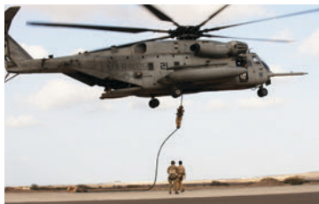
CH-53 SEA STALLION