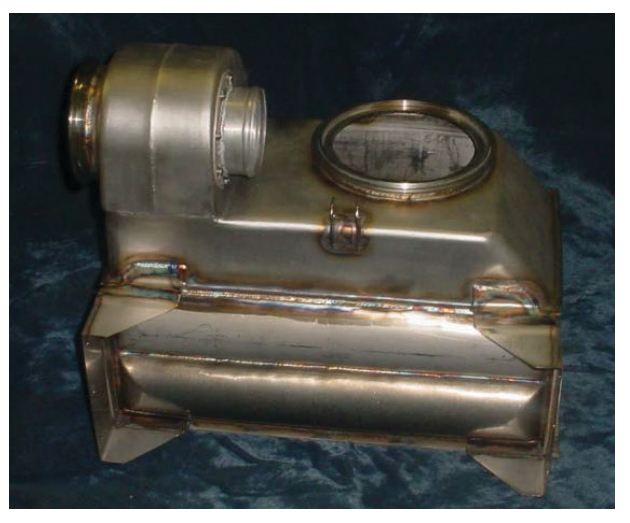
FLIGHT DECK HEAT EXCHANGER