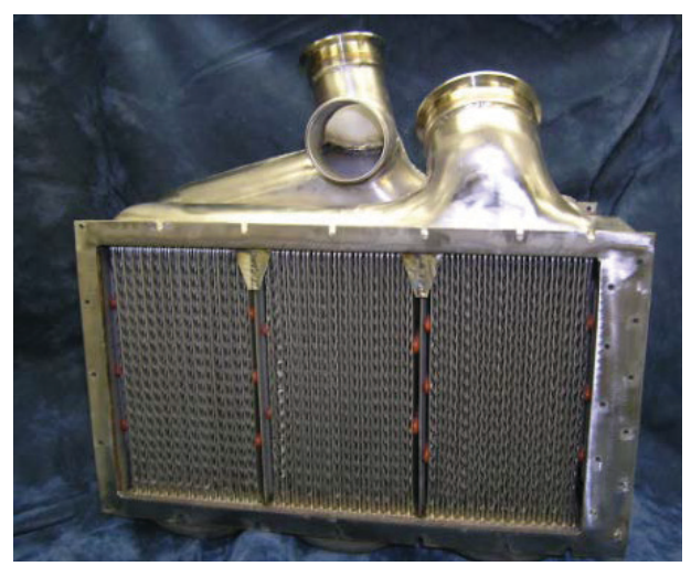
CARGO DECK HEAT EXCHANGER