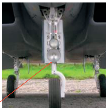
PAR 46 (Top) and PAR 64 (Bottom) Halogen Lamp Life about 25 to 100 Hours