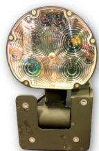
Harsh Environment - Immersion and MIL-STD-464 EMI Qualified Versions Available