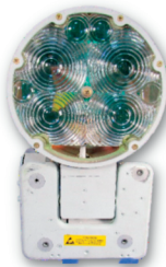
Visible Mode Only